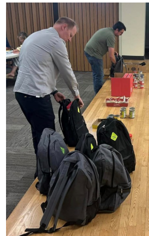
God's Work—Our Hands!