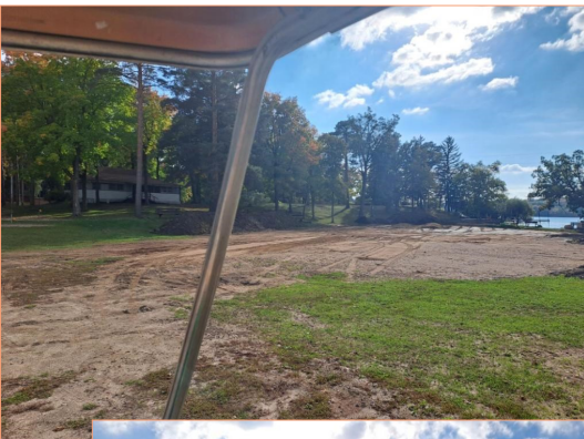
The Earth Mover....