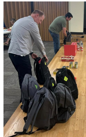
God's Work—Our Hands!