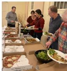
Cohort at Lutheran Church of Christ the Redeemer