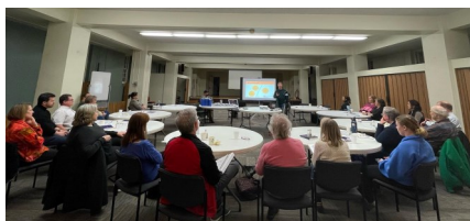
First gathering of cohort at St John’s in Nov.2023