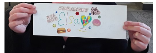
Decorating our own mugs....