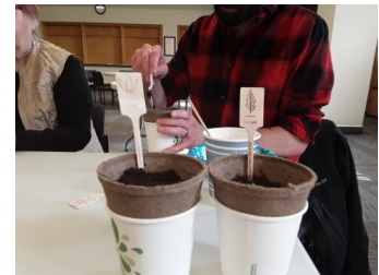
'4th Sunday' - planting herbs