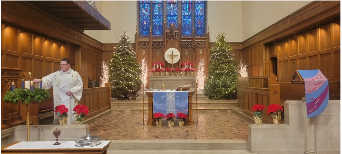
Lighting of the Advent Wreath—4th candle, Christmas Eve morning