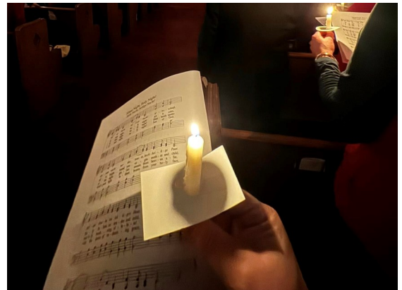
Christmas Eve 2023 at St. John's