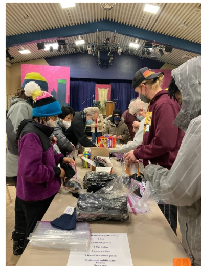
Our 2023 goal is to pack 500 cold weather kits

REGISTER ONLINE: HTTPS://WWW.SIGNUPGEN IUS.COM/GO/10C0948ADA 823A4FAC34-JAN14MLK