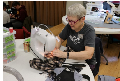
Fix-It Clinic