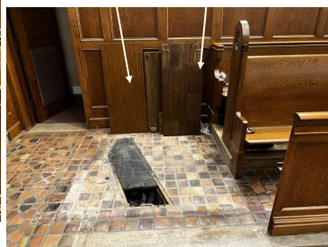
Organ dismantled and removed; being rebuilt offsite at Grandall & Engen shop.